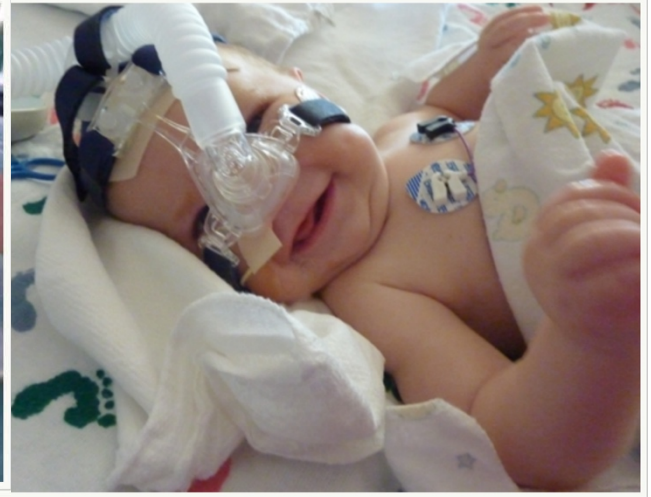
Posted Jun 22, 2014 6:04pm Smiling at Grandpa!