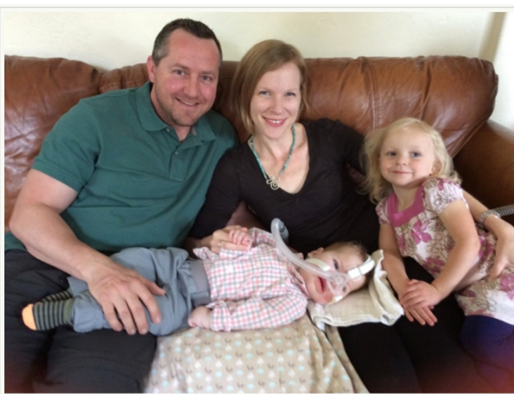
Posted May 11, 2015 12:11am Mother's Day photo!