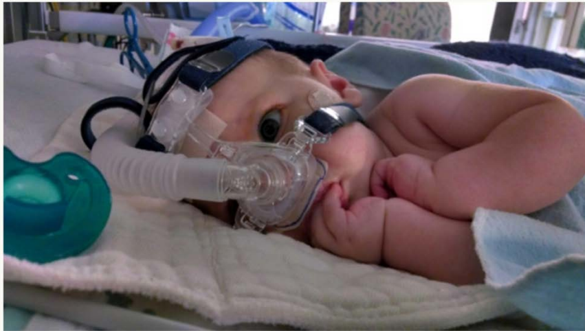
Posted Jun 19, 2014 1:18am Eyeing his pacifier, making do with his fingers.