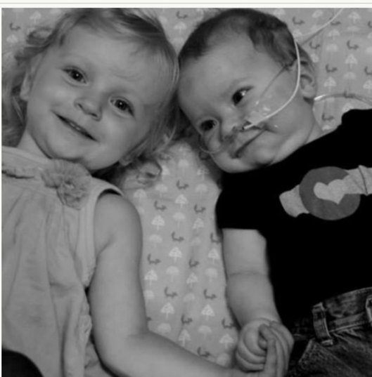
Posted Aug 30, 2014 11:52pm