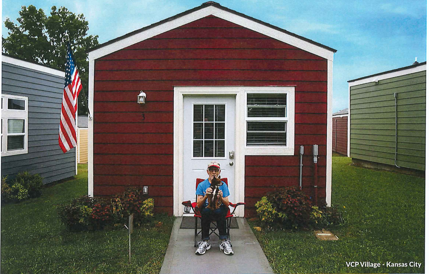
VCP Village - Kansas City